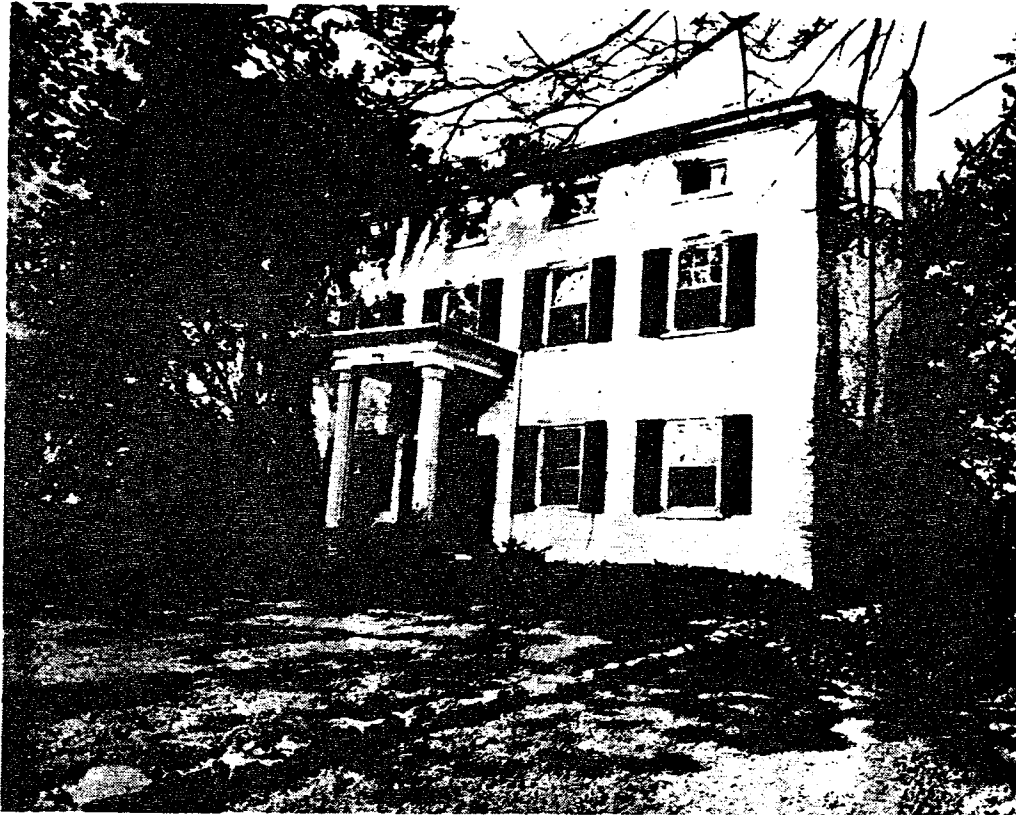
Robert C. Allen House