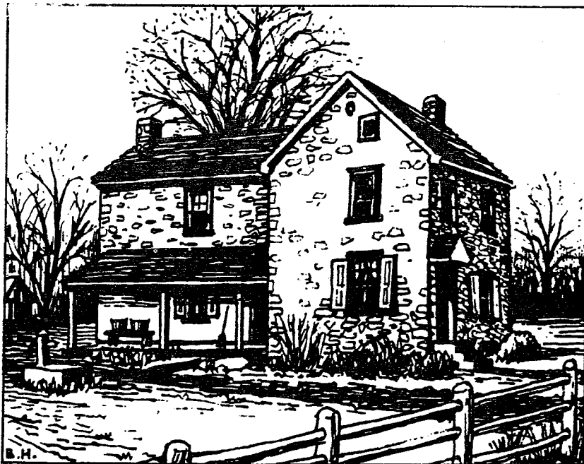
John White House As It Could Have Appeared in 1780