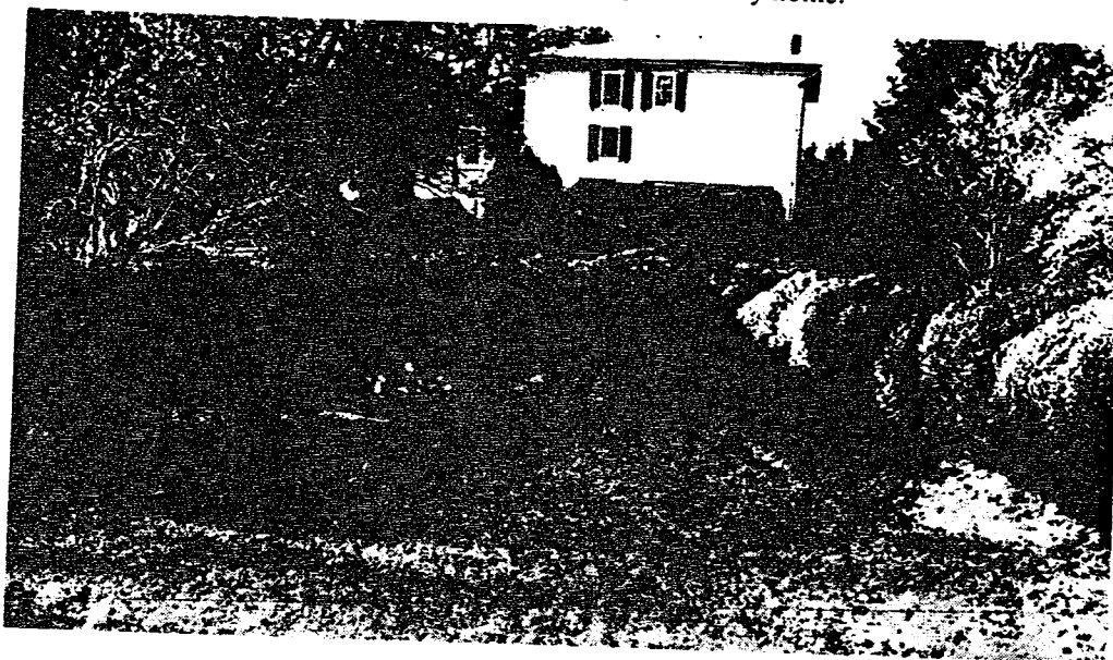
Boxwoods For Which Farm Was Named