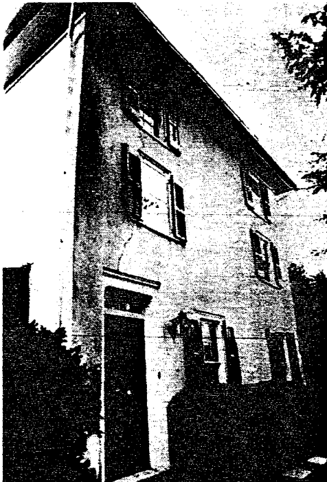
Front View of Olson Home