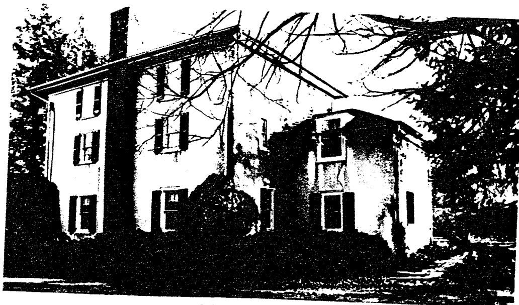
Side View of Olson Home