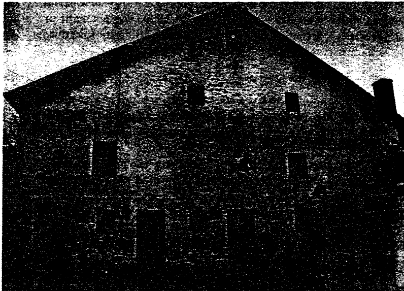
Stone Barn Built in 1800