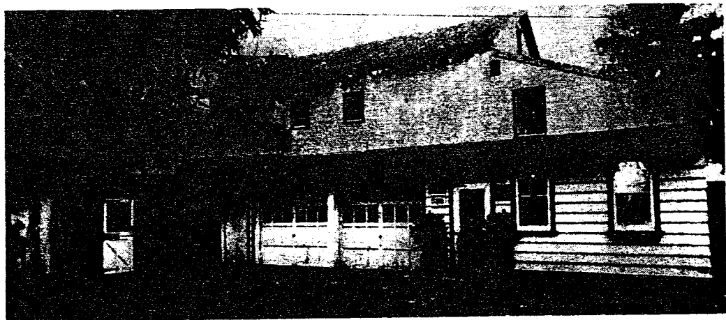
Veterinarian Building and Kennels