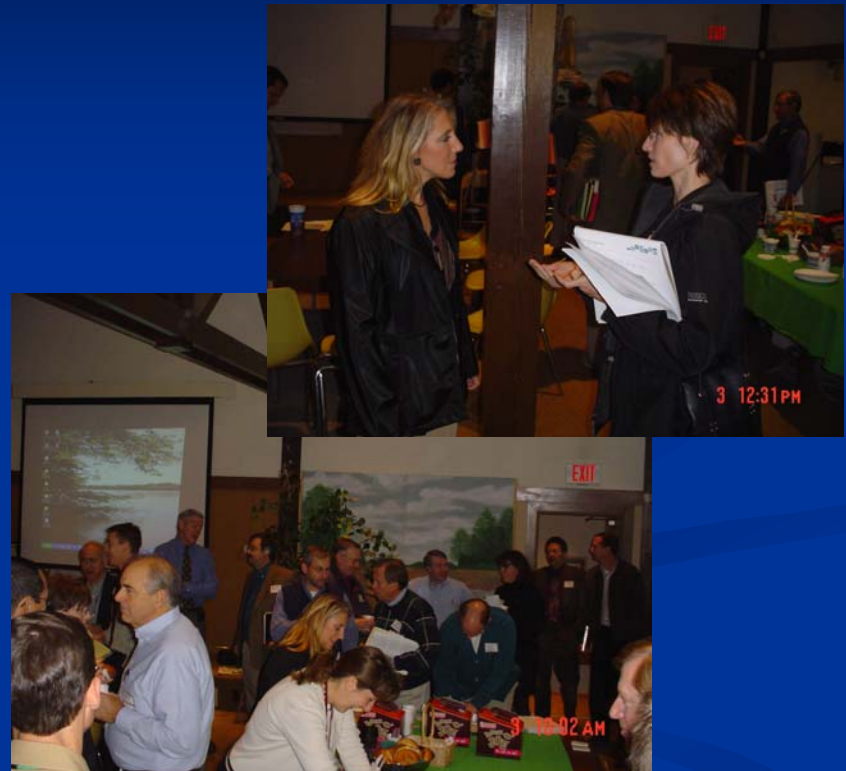
Wissahickon Watershed Partnership Kick-Off